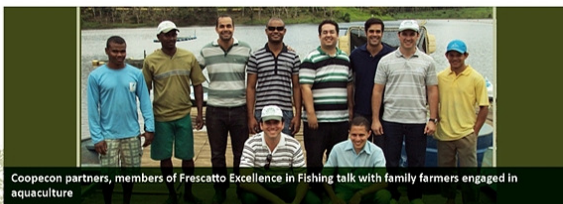
Coopecon partners, members of Frescatto Excellence in Fishing talk with family farmers engaged in aquaculture