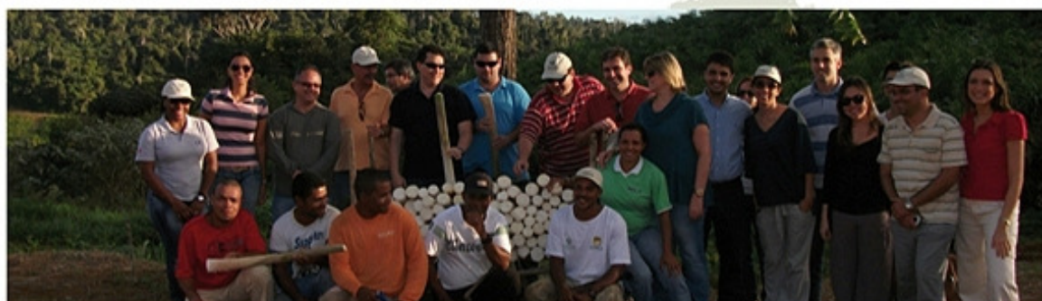
A delegation from Odebrecht Realizações visited the Mata do Sossego settlement for a meeting and informal conversation with Coopalm members