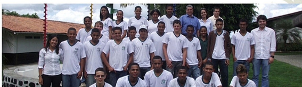
Representatives from the Conest joint venture - formed by Odebrecht Engenharia Industrial and Construtora OAS – learned about the work of the Southern Bahia Lowlands cooperatives, focusing on family farming