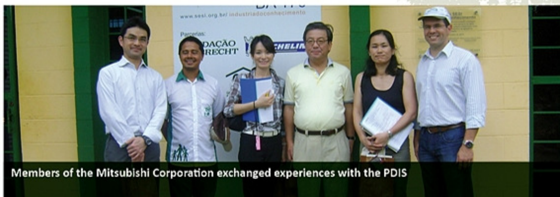
Members of the Mitsubishi Corporation exchanged experiences with the PDIS