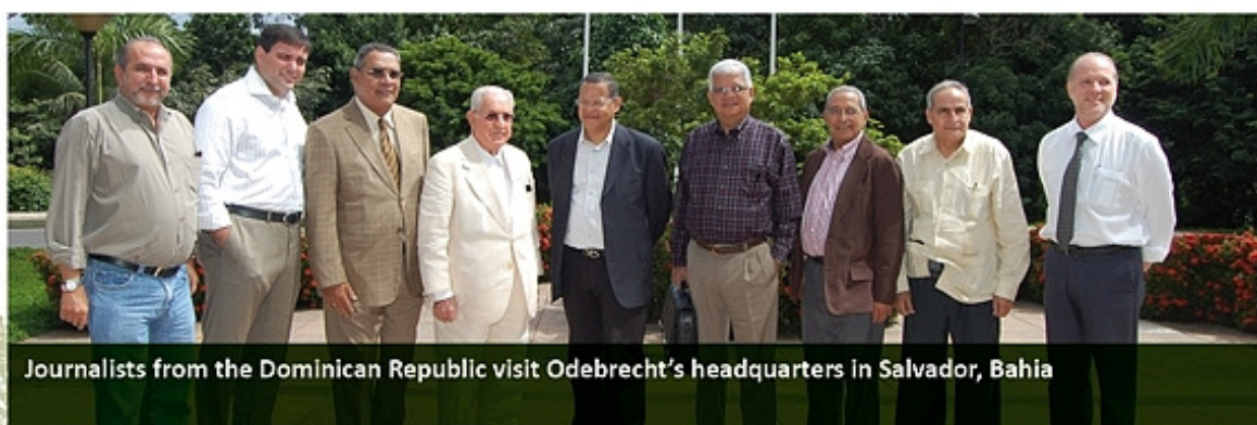
Journalists from the Dominican Republic visit Odebrecht's headquarters in Salvador, Bahia