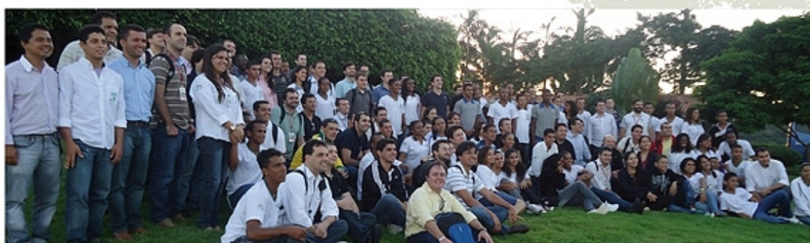
CFR-PTN students taking part in the Program for Developing Entrepreneurs (PDE), with members of the Engineering and Construction Area at the Odebrecht Organization