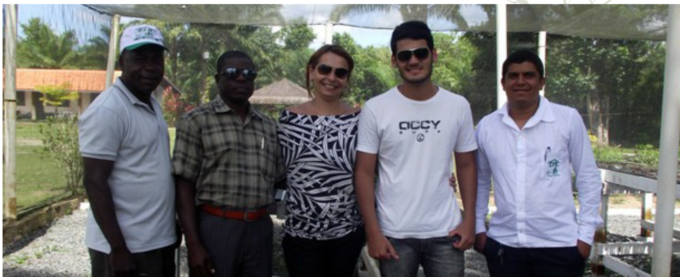
October 17th and 18 th : agricultural technicians from Lunda Sul Province in Angola, Africa, visited the area to learn about the PDCIS's initiatives