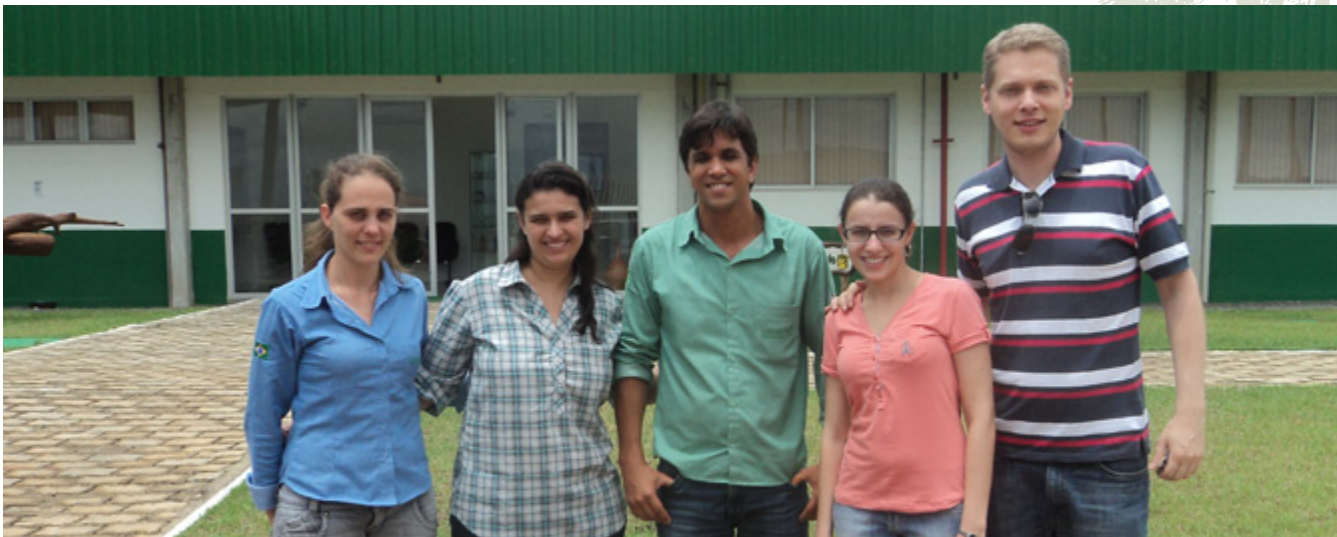
November 6 th and 7 th : Natura researchers were in Laje, Bahia, to see how the Starch Strategic Cooperative Alliance is organized. The visitors also shared their experiences about the use of cassava starch, since the Natura company already uses similar methods