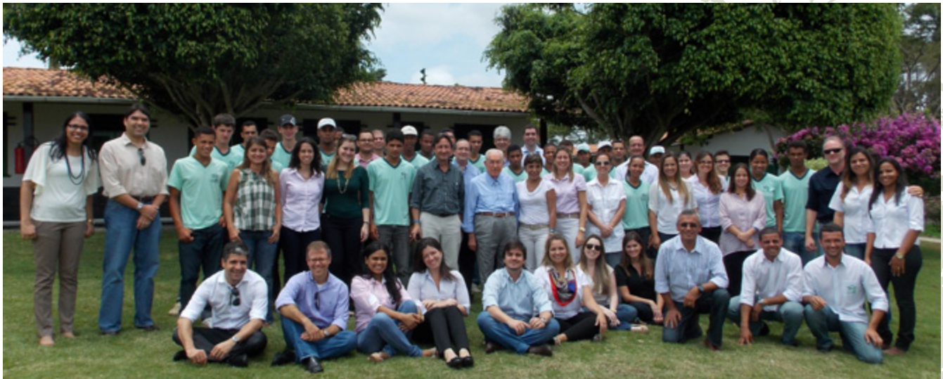
November 8 th and 9 th : twenty-five Odebrecht Organization communicators visited the Southern Lowlands to discuss media indicators and exchange experiences with the PDCIS. Some of the visitors stayed on in the area to learn about programs carried out by other institutions linked to the PDCIS