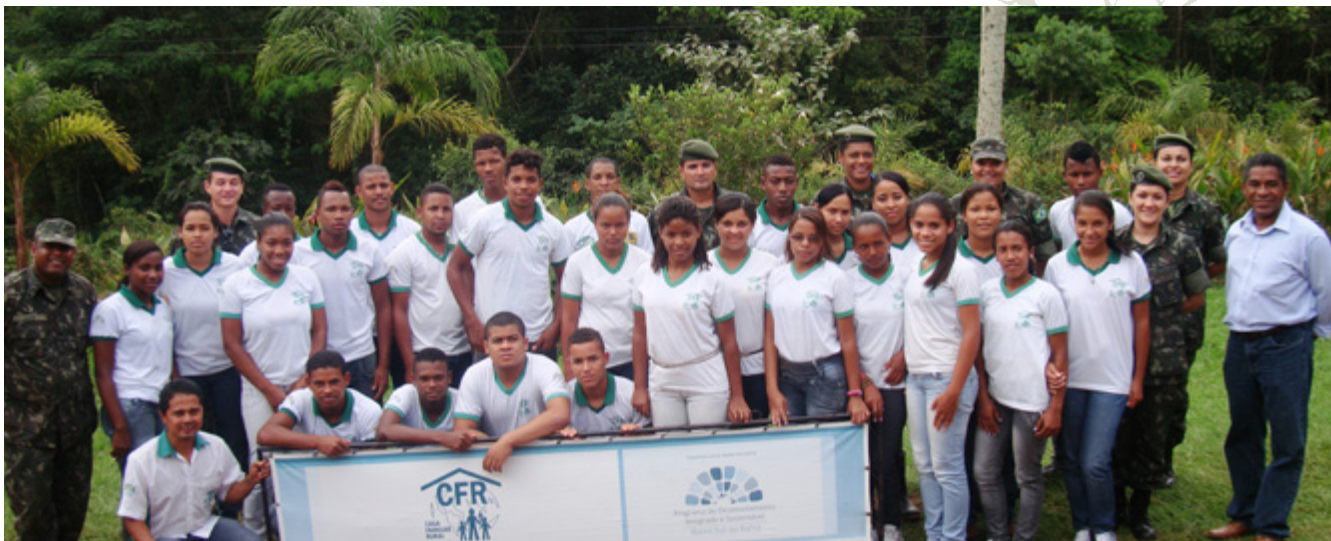
November 20 th to 22 nd : officers from the Military School of Salvador, Bahia, visited the State College Youth House and Rural Family House of Igrapiúna to get a first-hand look at the educational activities of the conventional formal education system and alternance system, respectively