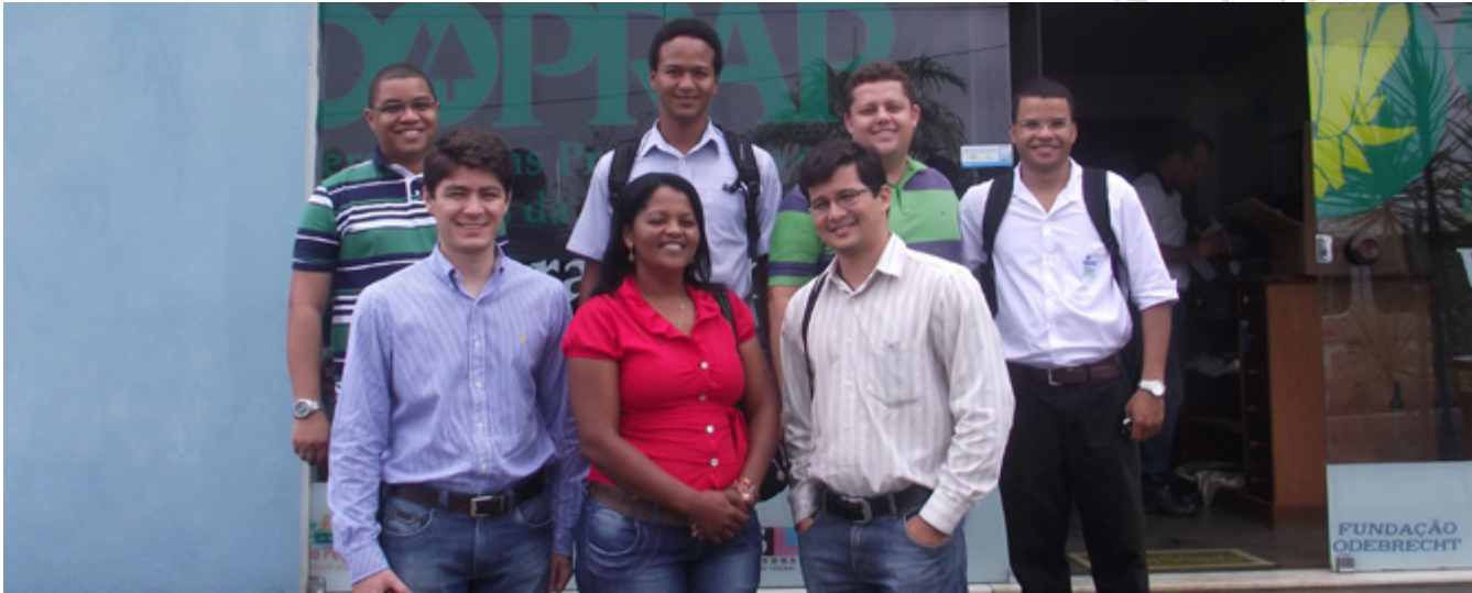
October 10 th : Representatives of the Bahia North Concessionaire, a subsidiary of Odebrecht Transport, visited the units that comprise the Piassava and Civil Construction Strategic Cooperative Alliances