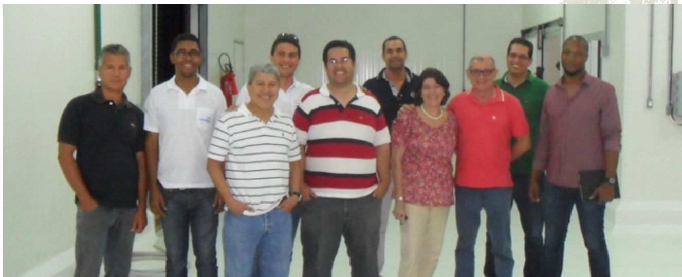
October 19 th : Bahia Pesca's members had access to the work of the Aquaculture Strategic Cooperative Alliance, focused on the contribution and strengthening of fishing activities in the region