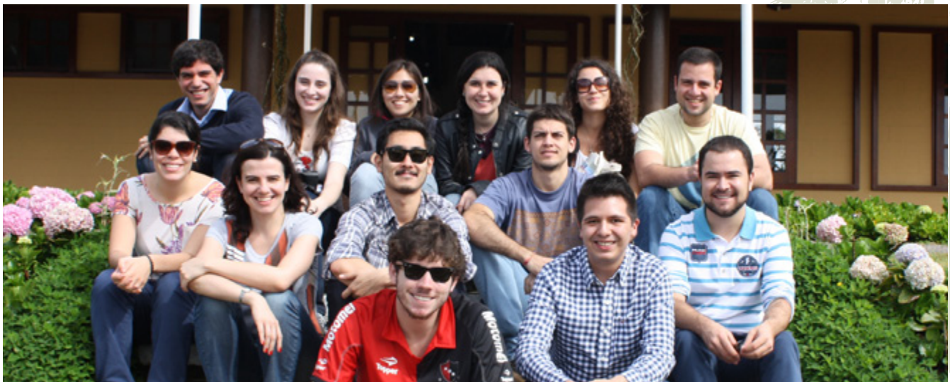
November 19 th and 20 th : a group of 12 trainees from the Folha de S. Paulo newspaper interacted with young people, visited the palm processing and fruit pre-processing units and learned about the work of the Pratigi EPA Guardian Association and the Land Conservation Organization